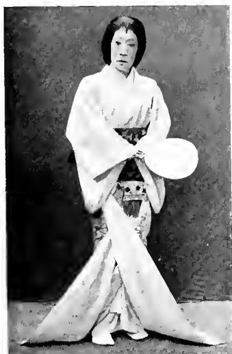
MR. DANJURO AS "LADY OF KASUGA" (p. 87)